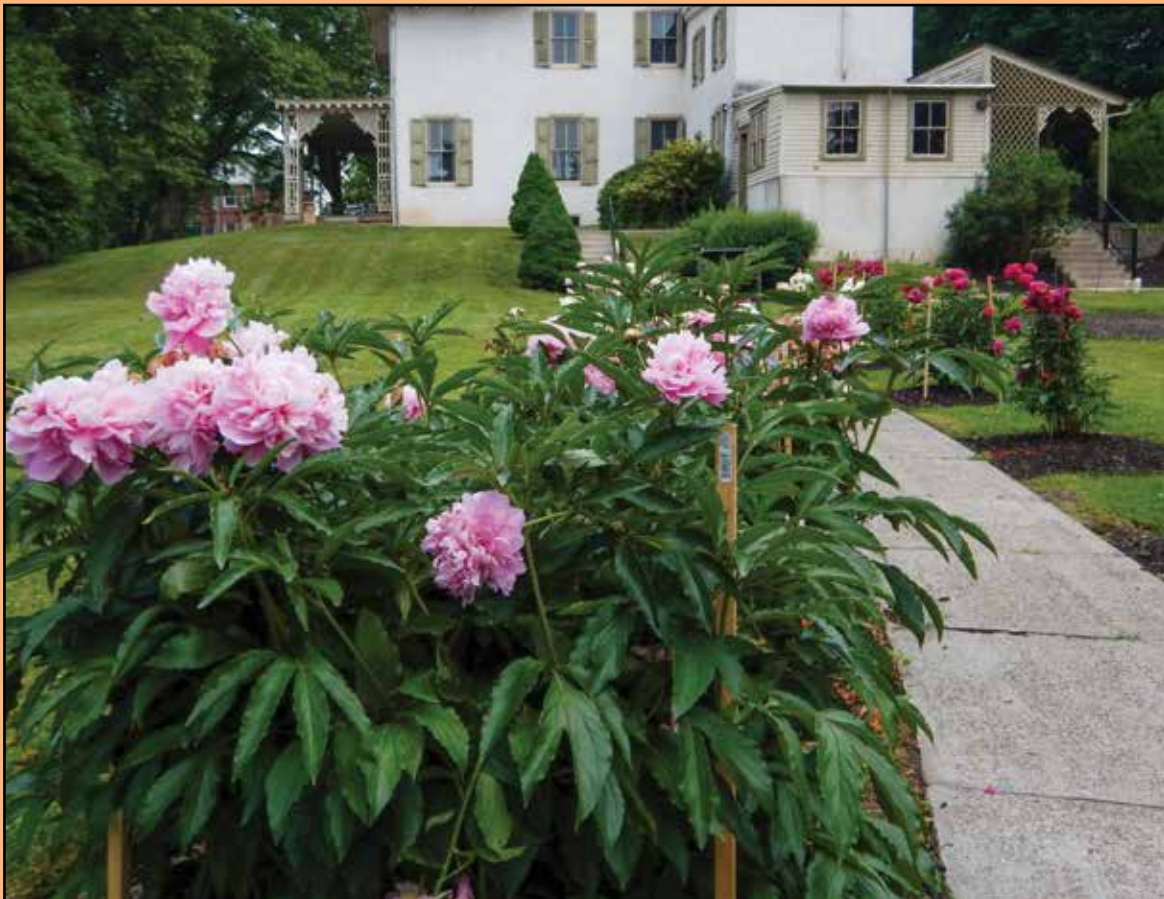
The annual flowering of the Peony Walk behind Terracina is an event visitors look forward to each year.