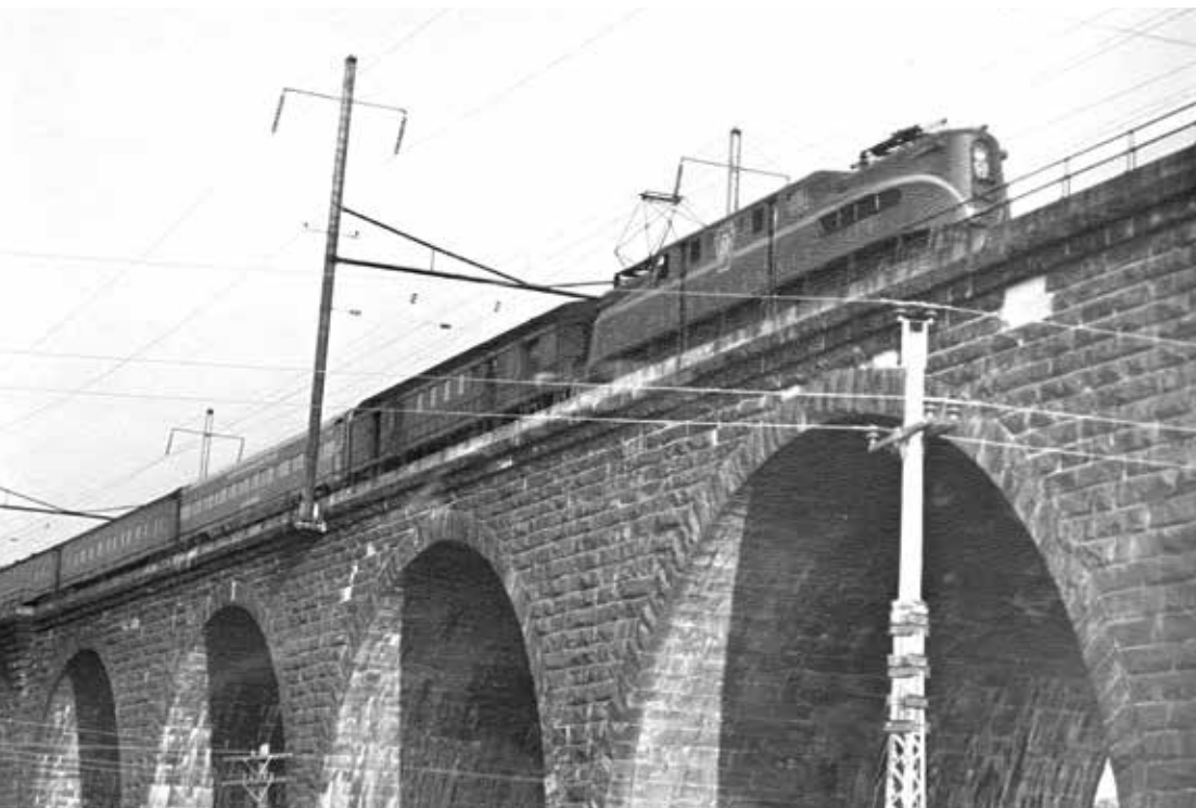
The Broadway Limited heads East over the High Bridge.