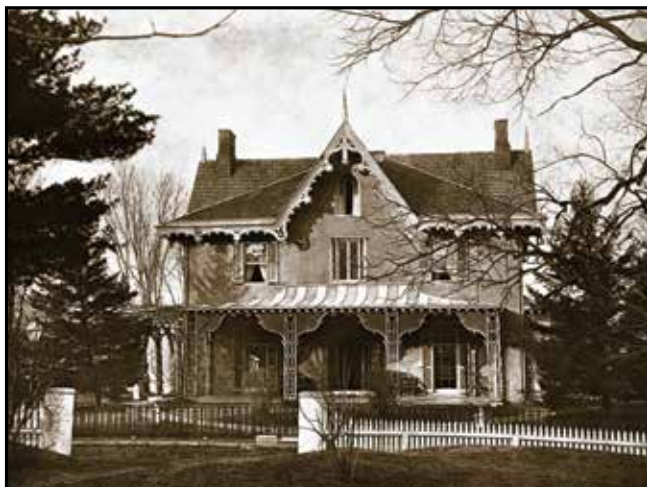
Chester County Day October 1, 10 am to 5 pm

Town Tours & Village Walks July 21, 5:30 to 7 pm