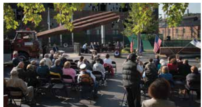
Coatesville Remembers 9/11 September 11, 8:30 to 11 am